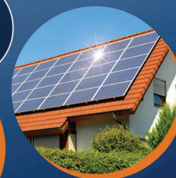
Power / Energy